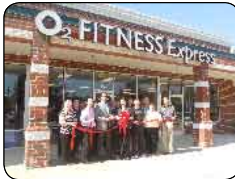
O2 Fitness Express 14460 New Falls of Neuse Raleigh, NC 27614 www.O2fitnessclubs.com 919-453-6360