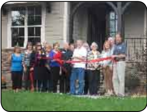
Grayson Homes, LLC P.O. Box 1253 Youngsville, NC 27596 www.graysonhomesonline.com 919-801-5434