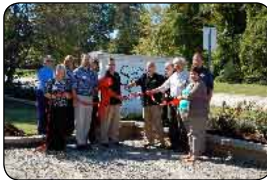
Green Sage, LLC 845 S. Main St. Wake Forest, NC 27587 www.mygreensage.com 855-605-7243 ext 701