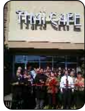
Thai Cafe, Inc. 3309 Rogers Rd., Suite 221 Wake Forest, NC 27587 www.ThaiCafeNC.com 919-453-1679