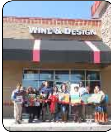
Wine and Design 3325 Rogers Rd., Suite 115 Wake Forest, NC 27587 www.wineanddesignnc.com/wakeforest (919) 453-0552